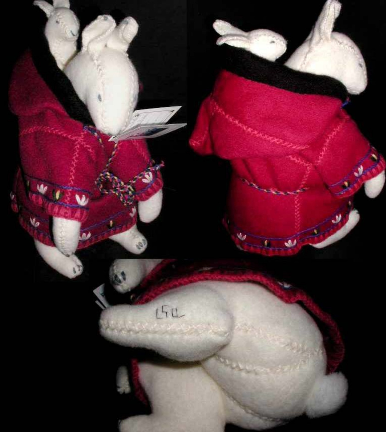
Tulaq Packing Dolls.