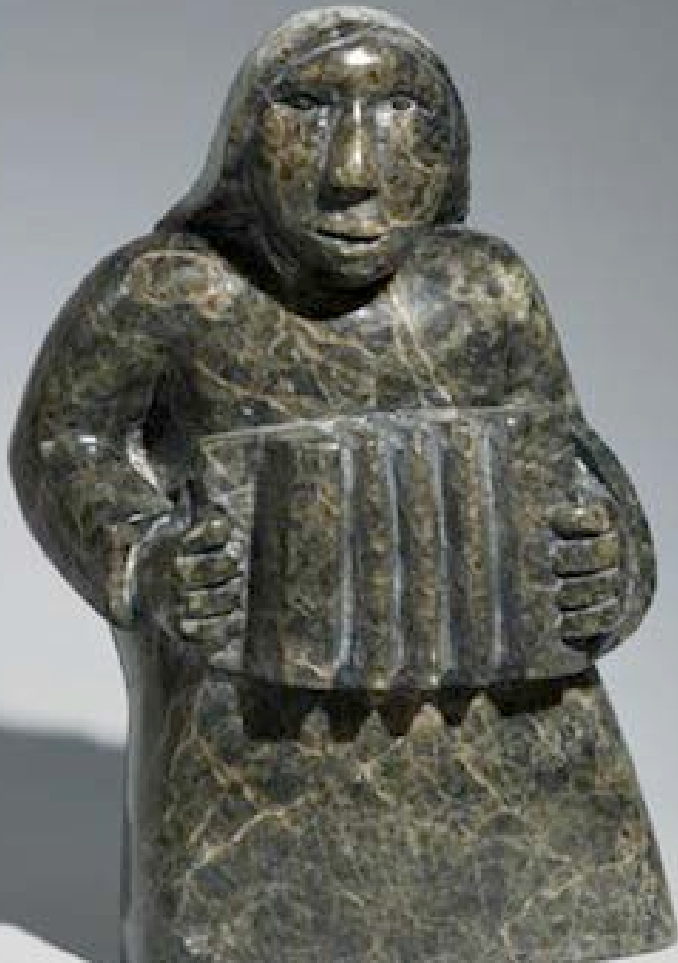
Ovilio Tunnillie's "Woman playing Accordion" from 2005.