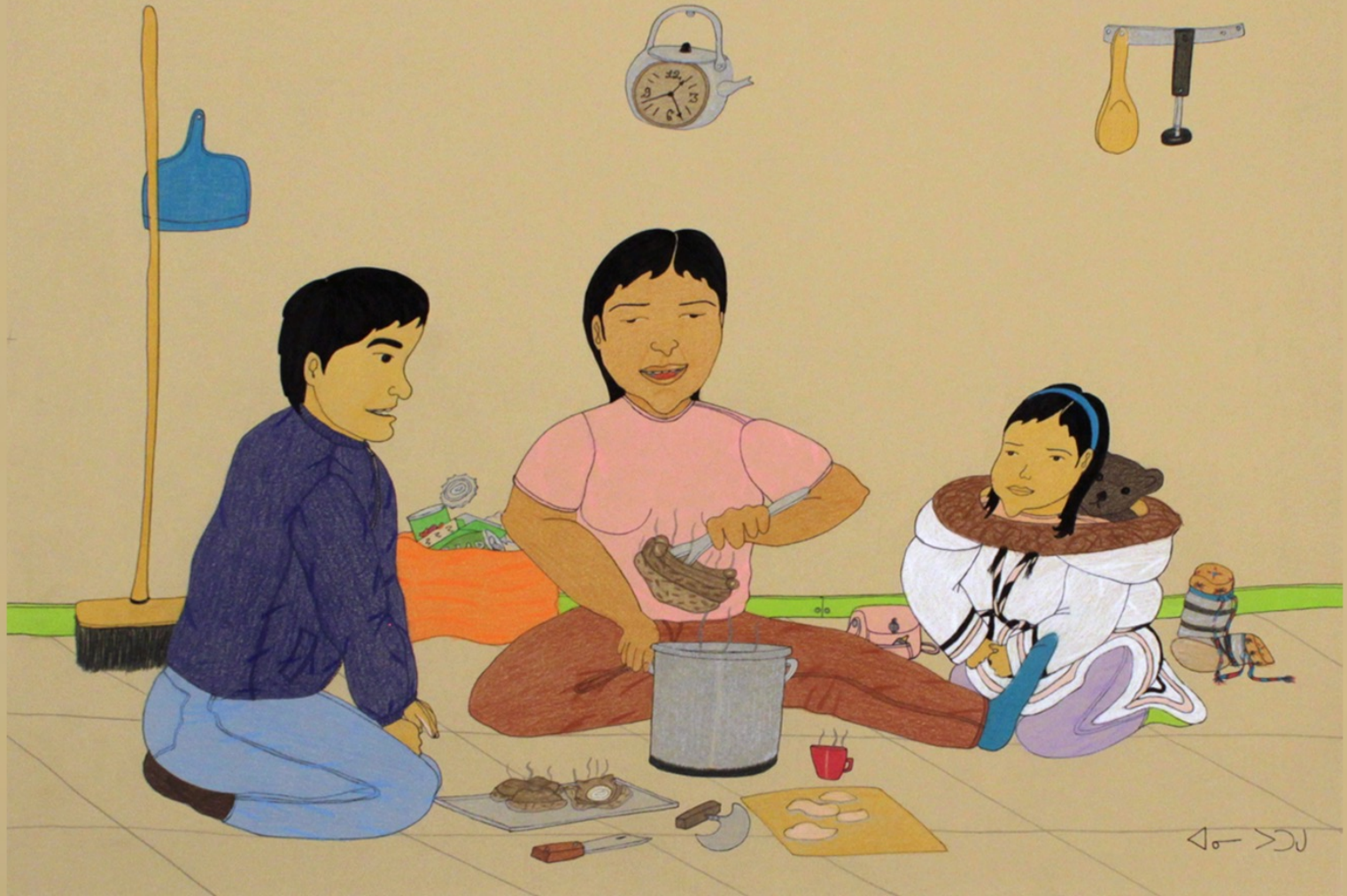
In dedication and memory of the late, great artist Annie Pootoogook. She will be missed.